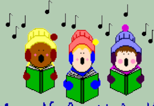
Silent Night, Holy Night

LSCC Christmas Program The program will be Friday, December 16th @ 7:00 p.m. in the church sanctuary. Classes that will be participating in the program will be the Sunflowers, Astronauts, Dragonflies, and Busy Bee's. Please check with your child's teacher for what they would like them to wear.