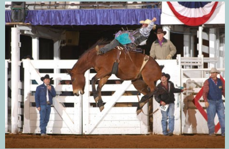
Friday, January 13 Cowboy/Cowgirl Day

This Month We'll Talk About . . . Happy New Year! Ride'm Cowboy Winter Weather Transportation What's Under Ground